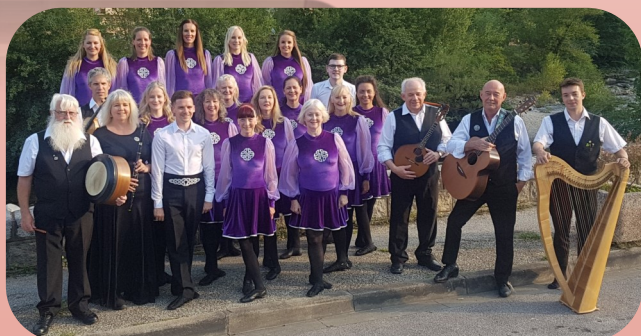
Discovery Highland Dance and Absolutely Legless showcased their talent and shared their unique culture with the rest of the world.