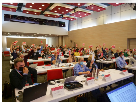
Voting at the Assembly