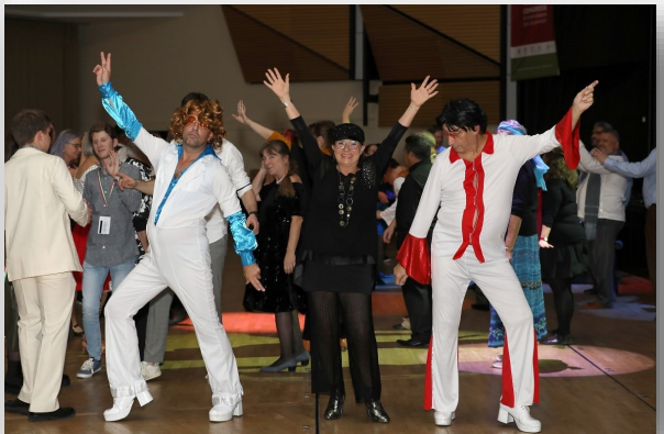
Game for a laugh! Our wonderful Hungarian hosts strike a pose.