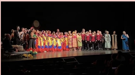
Storytelling Family Matinee of an Indian Traditional Tale: 'The Magic Bed'

There were also two matinee 'storytelling' performances where the groups performed to animate traditional tales as well as a collaborative version of The Two Frida's. This amazing performance launched the weekend, with the groups displaying their versatility in bringing their style to the stage after one rehearsal!