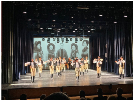
Living Traditions were demonstrated throughout.

A whole day at Szazhalombatta - home of the 'Rubik Cube' - was dedicated to showing us a selection the wide range of Intangible Cultural Heritage that CIOFF® Hungary has added to the UNESCO list. It really was a case of 'living traditions' as we were treated to falconry demonstrations, traditional 'Matyo' embroidery and textile designs, the notorious 'Boosho' (not unlike our own 'Hoodening' tradition), art-in-action and finally a wonderful choir recital in the unusual but beautiful town church. It was very inspiring and gave us lots of ideas to bring back!