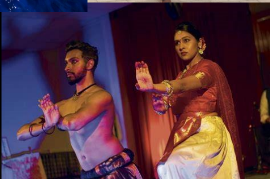
Balbir Singh Dance Company