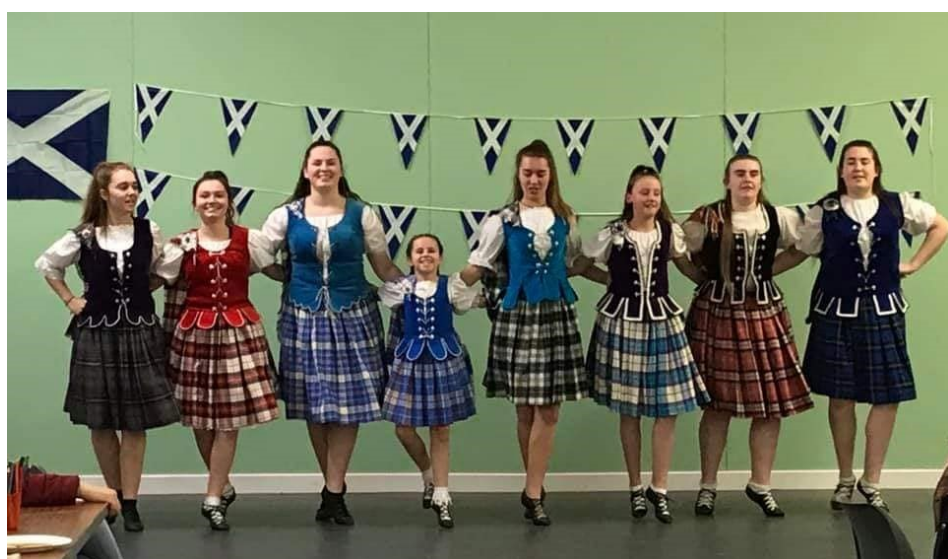
Discovery Highland Dance