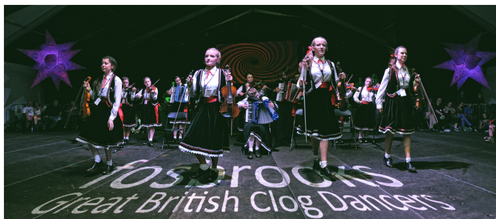
Fosbrooks Folk Education Trust